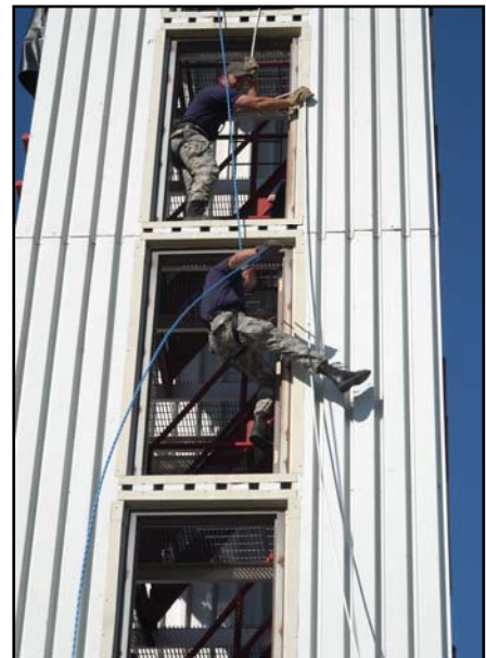
ESA Fire Tower Training