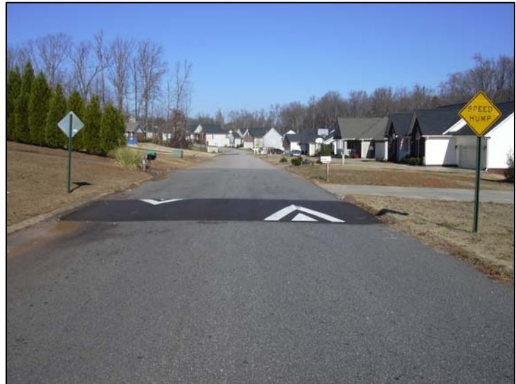
Laurelwood Drive Traffic Calming

This project will provide funding for installation of traffic calming devices at locations requested by citizen groups that meet conditions of the traffic calming policy. Citizens may request traffic calming in their neighborhoods by making a request, which is evaluated by the Public Works department for eligibility. Eligibility is based on traffic volume, average speed, and acceptance by impacted citizens.