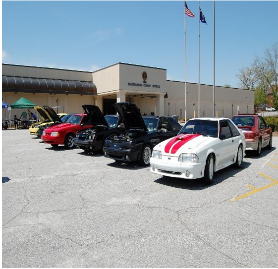
Spartanburg County Administration Building

PRSRRT STD U.S. POSTAGE PAID GREENVILLE, SC PERMIT NO. 1284